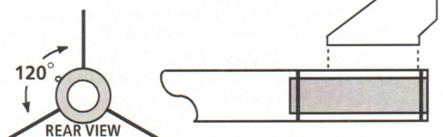
CROSS SECTION OF CENTERING RINGS/ MOTOR MOUNT TUBE ASSEMBLY IN MAIN AIRFRAME.